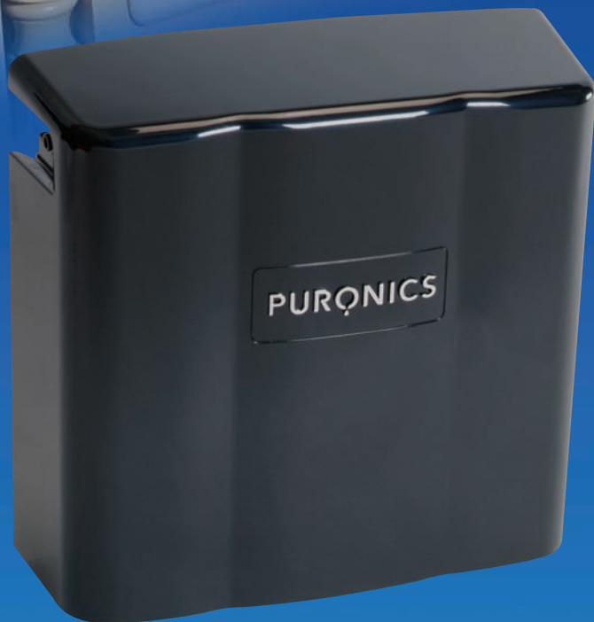
Food tastes better

The Micromax 7000 drinking water system is designed to produce crystal clear, clean, great-tasting water. The quality construction and superior performance of this system ensures maximum protection of your family's drinking water for years to come. The 4-stage advanced technology is packaged in a low-profile, sleek, durable design that fits easily under any kitchen sink. Refresh Yourself® with the peace of mind and high quality water that the Puronics Micromax 7000 provides.